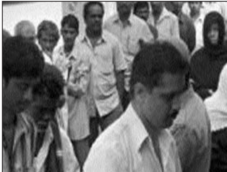
An indecisive suffrage: Their votes are yet to deliver a substantial result.

This limbo in formation of City councils is keeping many civic initiatives at bay. All those promises made in the hustings will take some more time to fructify into reality.