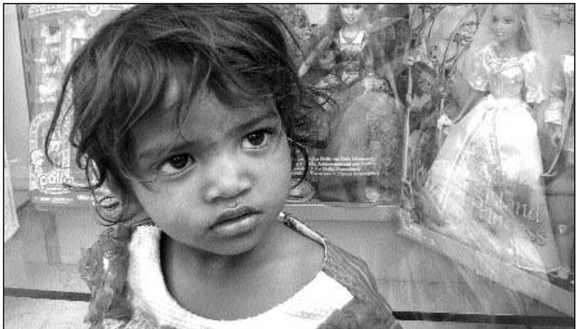
Despite its popularity, Barbie remains a distant dream for many poor children. Indian Economy may have experienced an eight per cent growth rate in the last four years. Yet it is estimated that two-thirds of its 1.1 billion inhabitants live off less than $2 a day