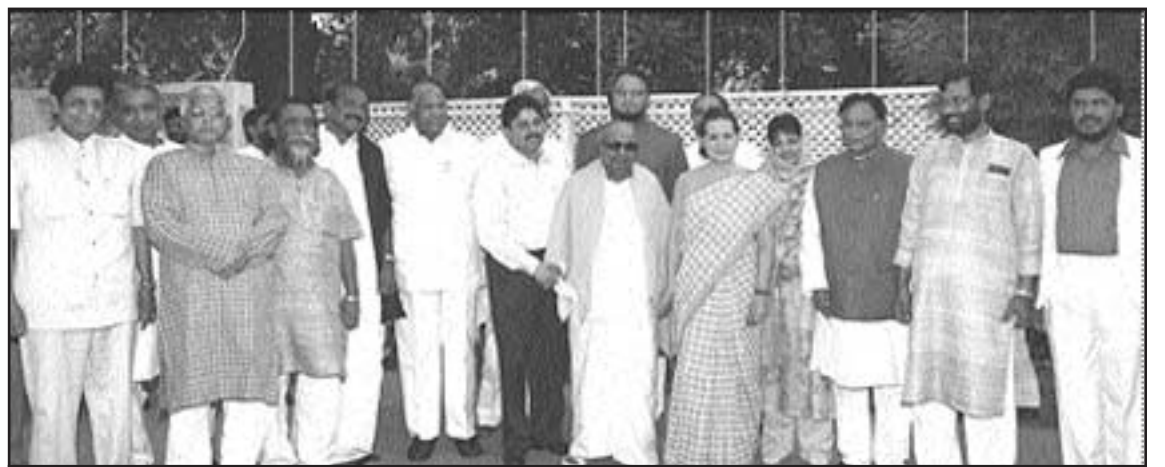
Ministers of UPA government with AICC president Sonia Gandhi's residence in New Delhi

The recent political upheaval in Karnataka is a perfect example of how things can turn bad in a coalition government. When Bhartiya Janata Party (BJP) and Janata Dal Secular (JDS) formed a coalition government in the state, they decided that the leaders of each of the two parties would be chief ministers for 20 months. But when the first 20 months got over, HD Kumaraswamy refused to accept the power transfer leading to a major political crisis. Though after a long battle, the political situation in Karnataka seems to have settled, there are still doubts about peaceful