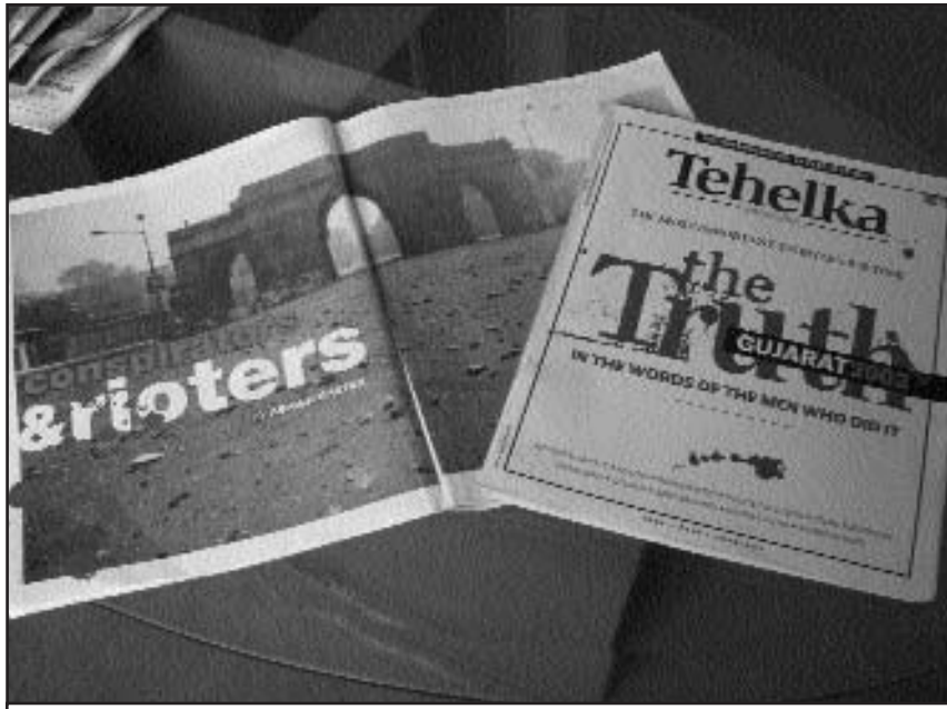
Tehelka releases sting videos on Gujarat riots