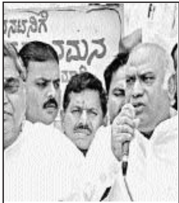
Mallikarjun Kharge speaks at Janandolan