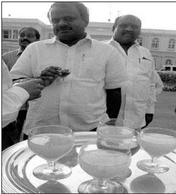
Don't worry!!! Indian public have a short-term memory

charges for food and stay comes around Rs.10, 000(for executive