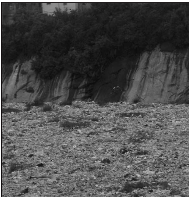
Stone quarry at Hennur Bande which is being refilled by author