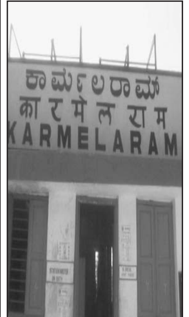
Only a few trains stop at this station

Karmelaram Railway Station on Sarjapur road is not well connected with Bangalore and neighbouring states. It also does not have a reservation counter in it.