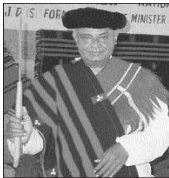
the vaneguard of Gowda dynasty

He was the driving force behind the Janata Dal's rise to power in the State in 1994. He was elected as the leader of the Janata Dal Legislative Party and on December 11, 1994 he assumed office as the 14th Chief Minister of Karnataka. Hethen contested as a candidate from Ramanagar Assembly constituency and won by a