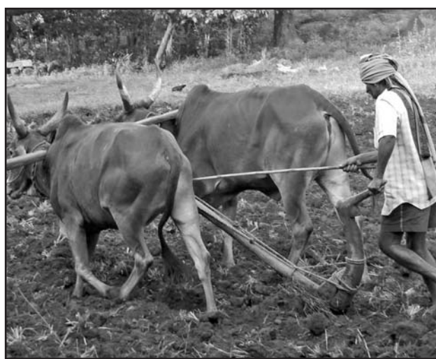
Long way to go, tough path

A member of the WTO may impose trade barriers on an import only if they can prove the injury to the domestic industry, however in the case of the African cotton farmers, the U.S gave into to global pressure only in 2006, five whole years after the problem was brought to the international forum. The current negotiations at the WTO recorded the need to have to different scales for different economies whether the new rounds will make a difference is yet to be seen.