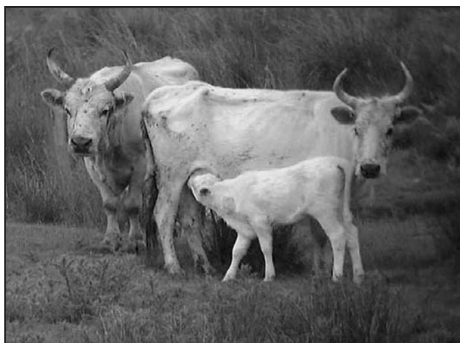
Indian cows' leather falls below world standard

"Since their production is high and demand is not up to the mark, their leather is cheaper rather than Indian ones, even after adding transportation cost," he added