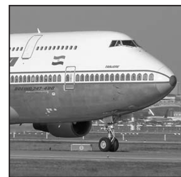
Yet to take-off

that Indian companies save money because of the proximity and hence, these taxes."