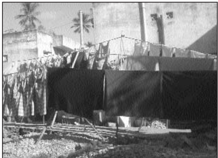
Clothesline being hung in the premises of the Kempambudi Lake